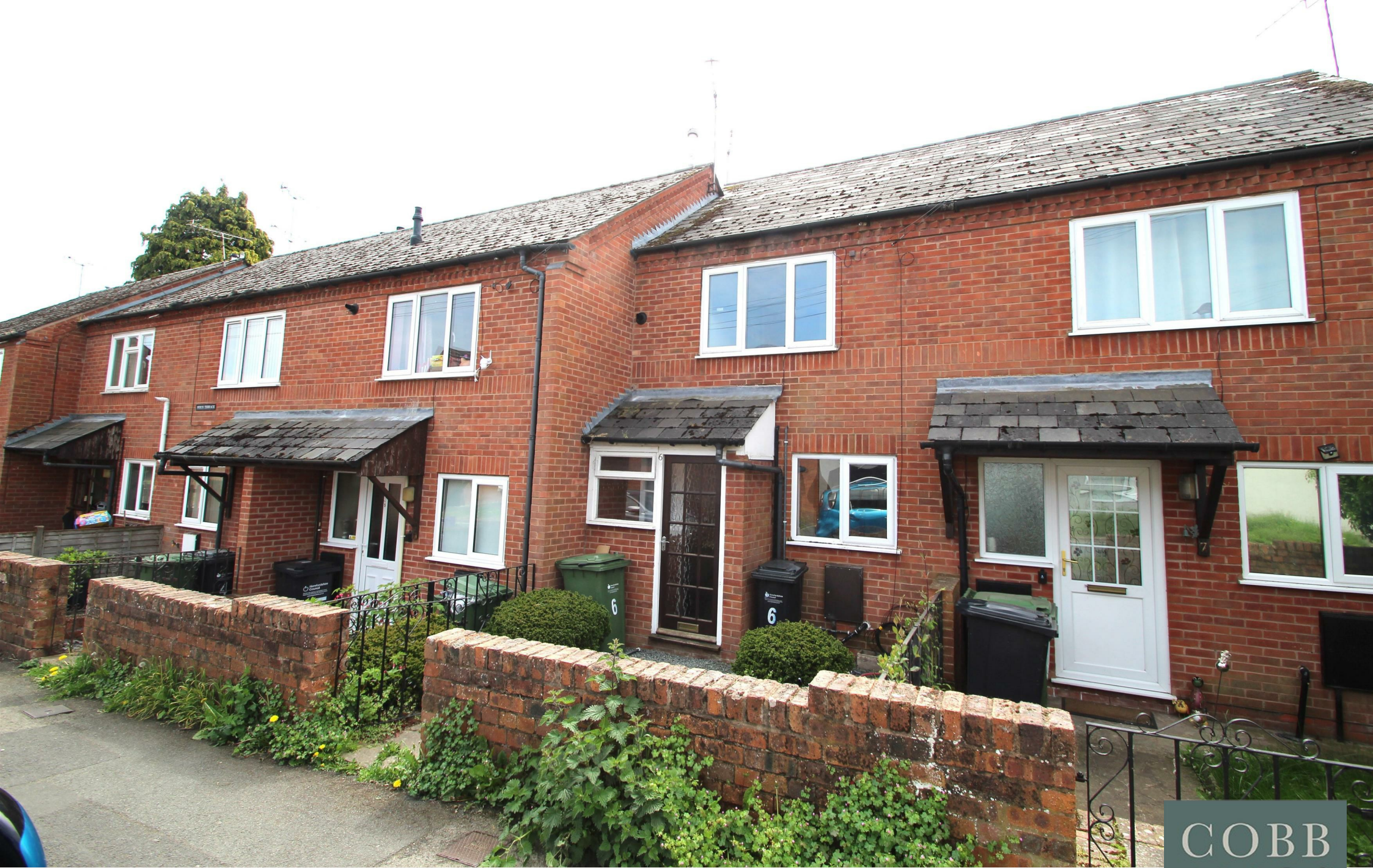
6, Beech Terrace, Leominster, HR6 8LW Price £180,000